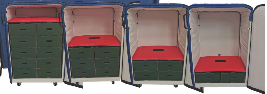
Performance Roll Cage Chilled Produce (30 hours from 1130)